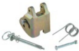
PL-N/O Latch Kits