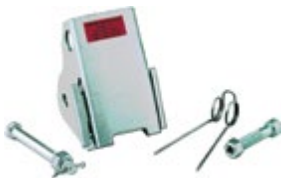
PL Latch Kits